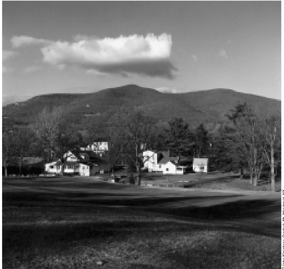
Overlook Mt. Woodstock, NY

RIP VAN WINKLE CAMPGROUNDS * (800-290-5450) ripvanwinkle@prodigy.net .